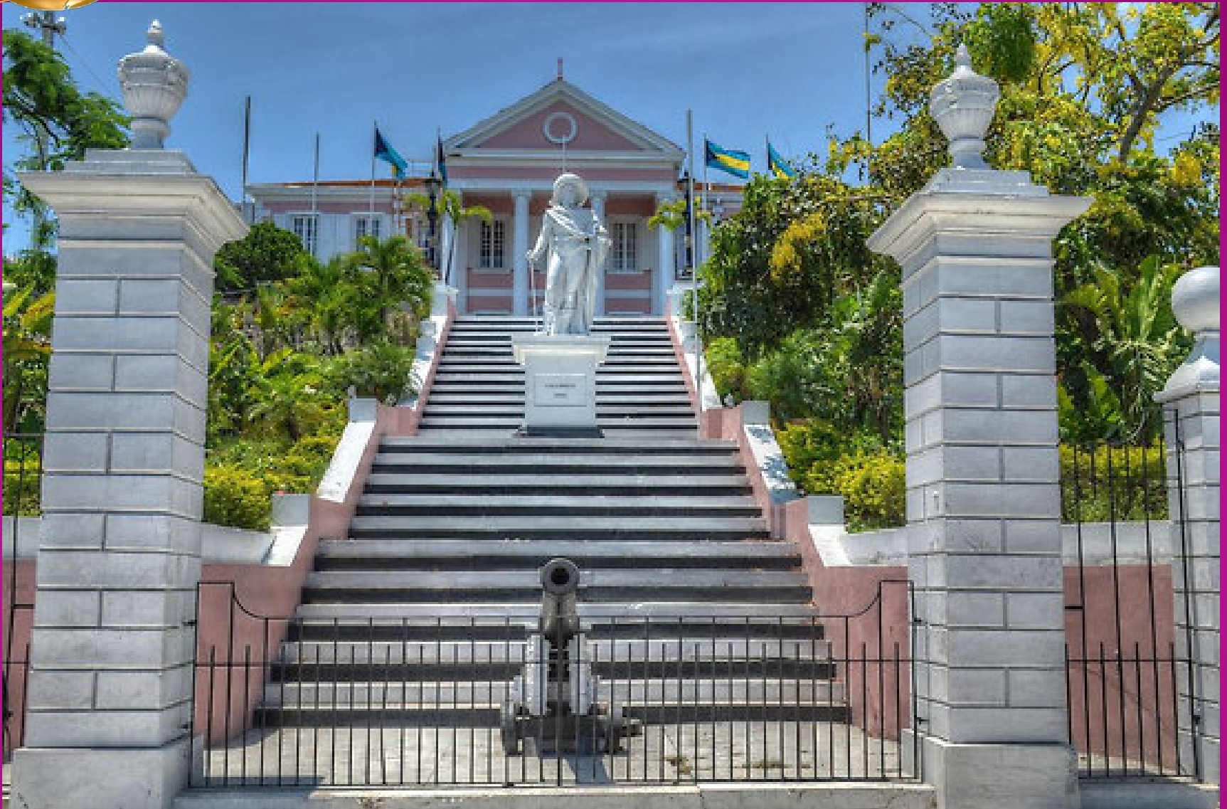
THE GOVERNOR'S MANSION