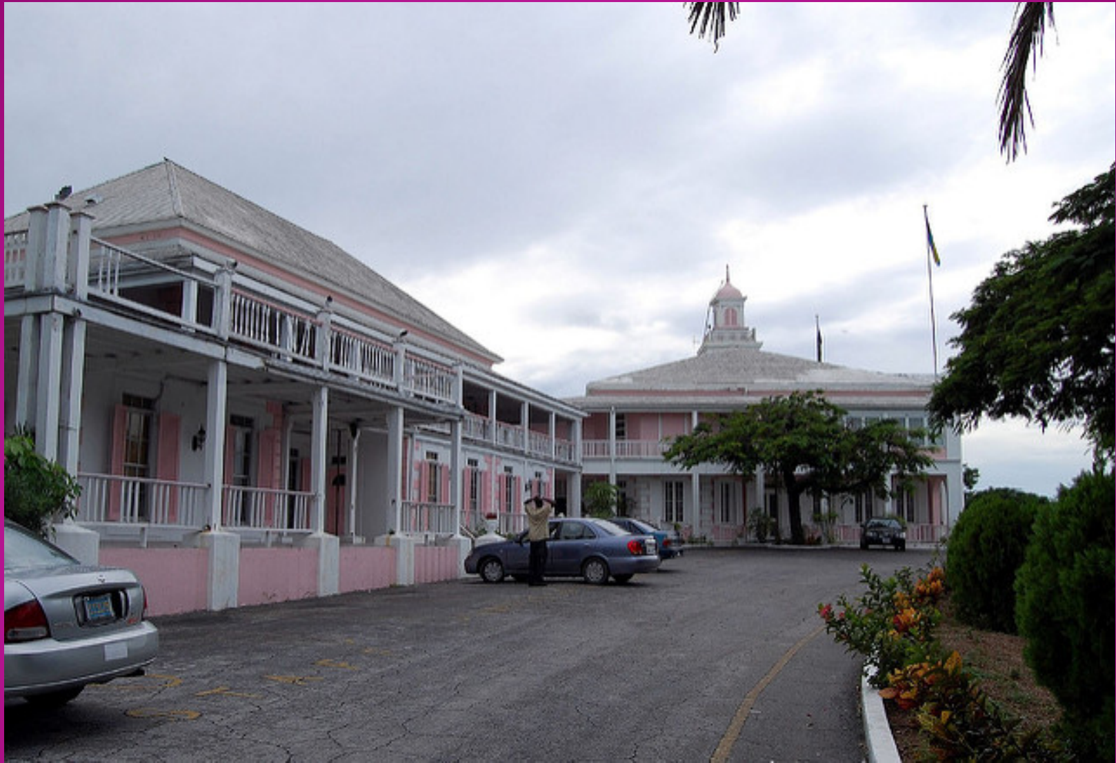
THE GOVERNOR'S MANSION